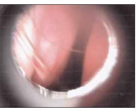
Figure 1. Nasoendoscopic photo of 'boggy inferior turbinate before (left) and after (right) one month of treatment with intranasal corticosteroid/ antihistamine spray. Improvement in nasal congestion is visible

exceptions to these seasonal patterns exist. Specific area specific pollens such as ragweed and rape seed may also be of importance in certain parts of Ireland. Certain pollen counts tend to be higher on dry, sunny, windy days. Outdoor exposure can be limited during this time, but this may not be reliable because pollen counts can also be influenced by a number of other factors. Keeping the windows and doors of the house and car closed as much as possible during the pollen season (with air conditioning, if necessary, on recirculating mode) can be helpful. Taking a shower after outdoor exposure can be helpful by removing pollen that is stuck to the hair and skin.